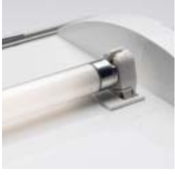
Energy efficient 6 W fluorescent lamp with good colour rendering