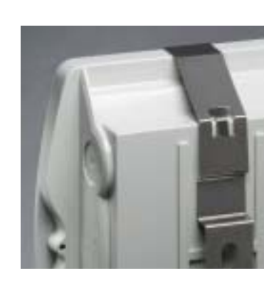
Special brackets for quick mounting

Special mounting accessories (recessed, square and suspended) let you install your emergency lighting wherever you like. Irregularities on the wall surface can easily be eliminated using the adjustment system specially designed for this purpose.