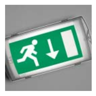
Uniform illumination with LED's