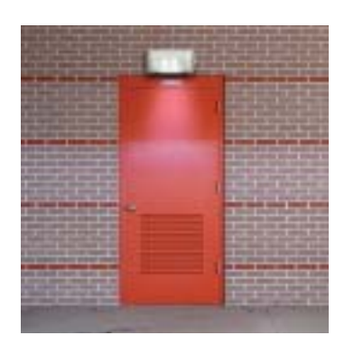
Safe in outdoor applications