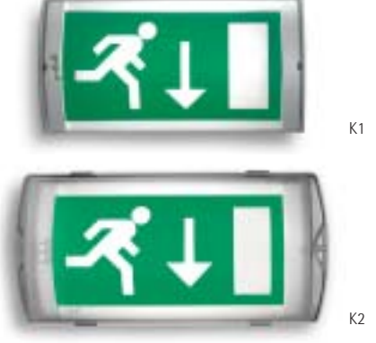
Consistent family concept in your building

Together, K1 and K2 provide a consistent family concept, allowing you to meet all of your building's specific emergency lighting requirements.