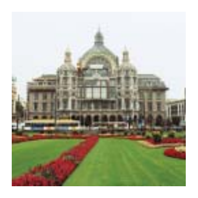
Safe in public rooms