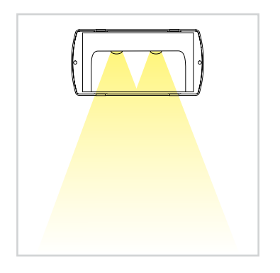
Lenses guarantee 1 lux on the floor at a suspension height of up to 5 m