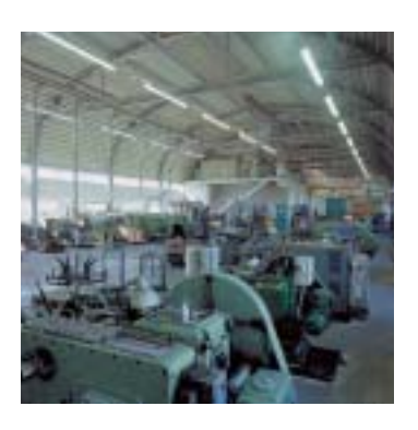
Safe in environments with high levels of humidity and high dust concentrations