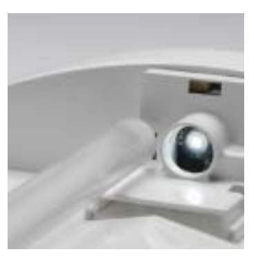
LED-lighting guarantees long life