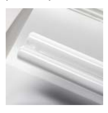
11W TC-S lamp for increased luminous flux

For single and double sided signage LED's can be used. Because of their long life, LED's are particularly suitable for maintained signage. The light output of LEDs decreases gradually, that is why a built-in control system warns you when the illumination of the pictogram drops below the minimum established level. In outdoor applications LED's easily start at very low temperature conditions. K2 LED's have an expected life of over 10 years, and therefore require significantly less maintenance.