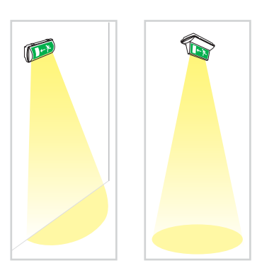
A light window gives 1 or 5 lux on the floor at a normal suspension height