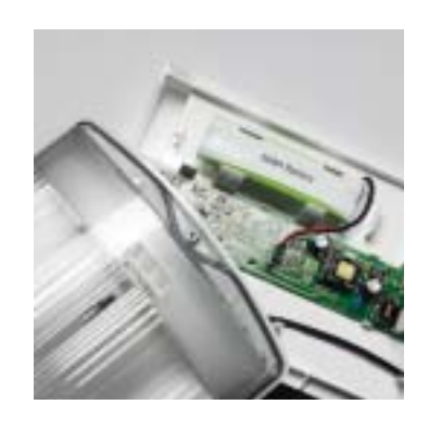
Nickel metal hydride, less environmentally harmful

Non-maintained K2 luminaires are optionally available with nickel metal hydride batteries (NiMH). They are standard in K2 LED luminaires for outdoor applications. NiMH batteries are more compact, do not contain cadmium and are therefore less environmentally harmful. The life of these batteries has been optimised by using an ingenious charging process: maximum one hour per day is all that is needed to recharge the batteries.