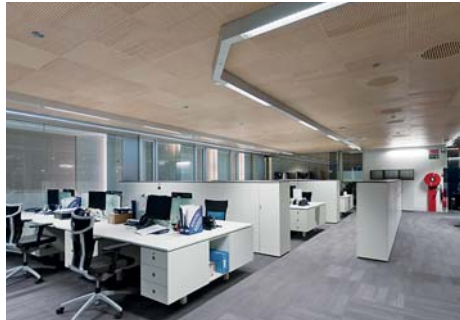
Regional head office Naturgas Energía, Bilbao, Spain LEED Platinum / Completion 2013 ETAP solution with Kardó modular light lines and D42 LED downlights