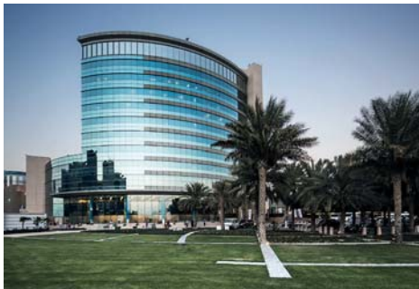
Headquarters Majid Al Futaim, Dubai, United Arab Emirates LEED Gold / Completion 2014 ETAP solution with Flare spots, D42 downlights, R7 suspended luminaires with occupancy detection and U7 recessed luminaires (all LED)