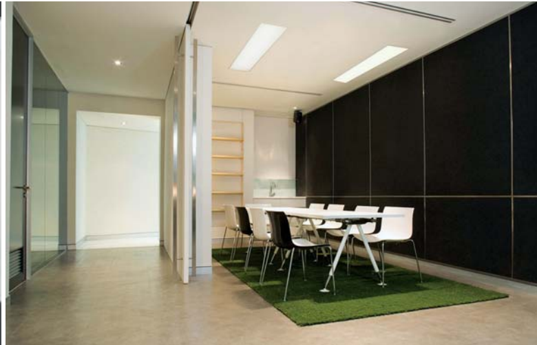
Simulation software tests reveal that ETAP's U25 recessed luminaires can earn 7 points.