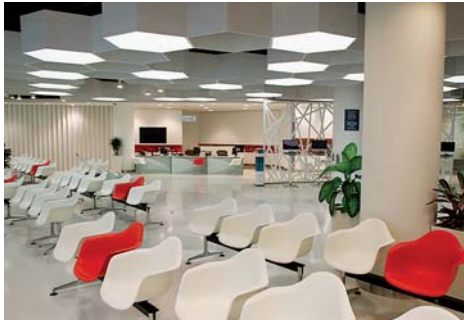
Chamber of Commerce, Dubai, United Arab Emirates LEED Certified / Completion 2011 ETAP solution with bespoke fluorescent lighting, D42 LED downlights and Flare LED spots

ETAP has many years of experience in the certification of building projects. Your ETAP adviser will be happy to assist you with the right solutions for BREEAM or LEED certification, the two most popular systems (*). ETAP has many years' experience in building certification. Below are some examples of reference projects.