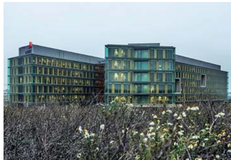
Head office PriceWaterhouseCoopers, Gasperich, Luxemburg BREEAM Very Good / Completion 2014 ETAP solution with UT1 recessed luminaires, R8 and R4 mounted luminaires and E6 industrial luminaires.