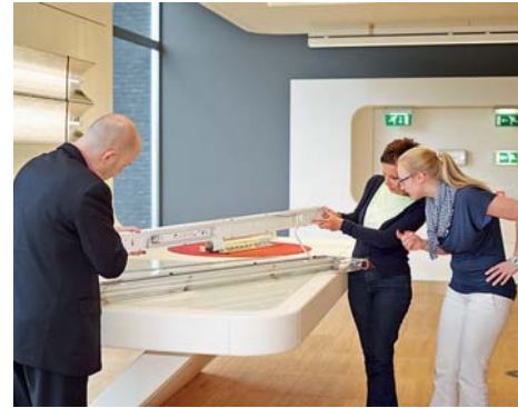
From development over production up to services: each aspect of ETAP's product flow has been examined for this product analysis.